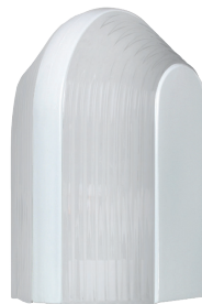
313953-FR White with Frost option