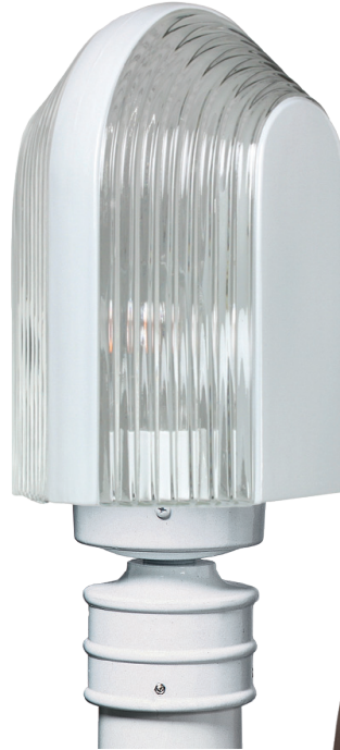
313953-POST White with Post Fitter

May be used in Interior or Exterior applications.