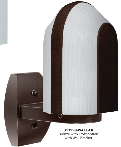
313998-WALL-FR Bronze with Frost option with Wall Bracket