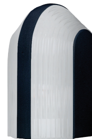
313957-FR Black with Frost option